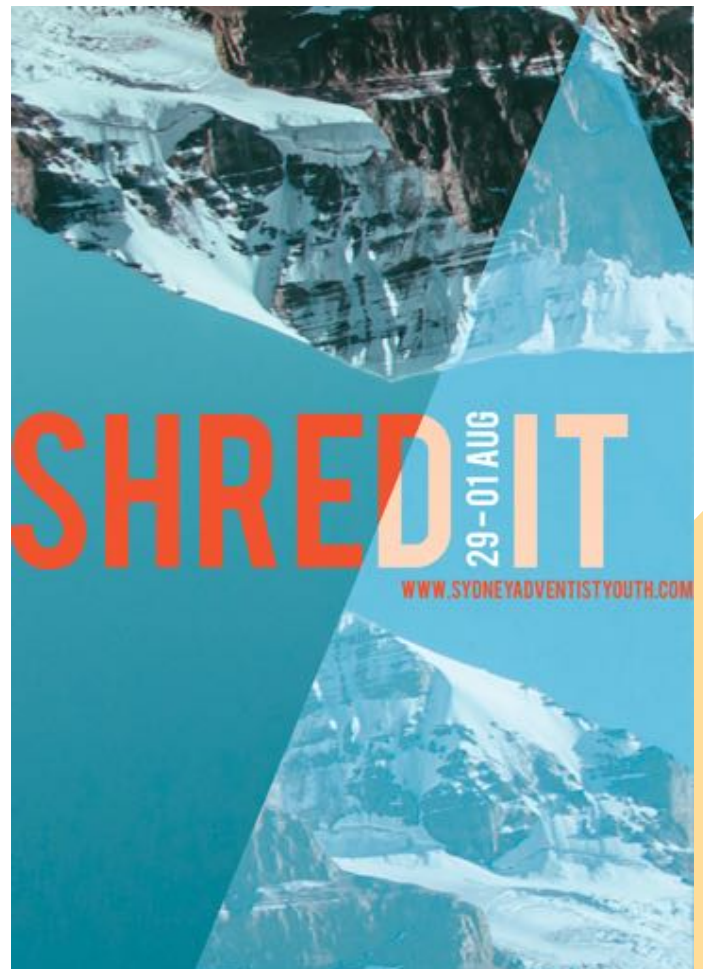
Shred it - July 29 to August 1 2016