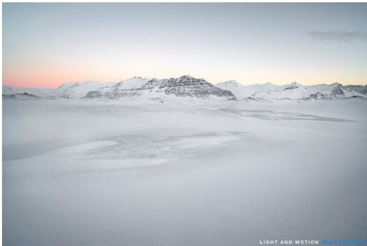
“Alpine Glow” taken in Iceland