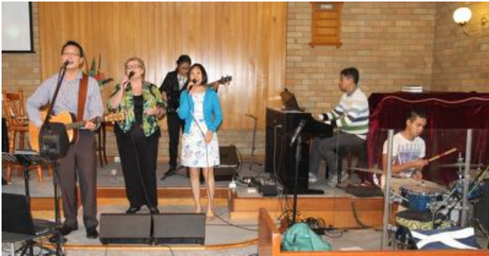
Praising and worshipping with our Song service

These are some photos from our service last Sabbath. Thanks for your message Raul Moran.